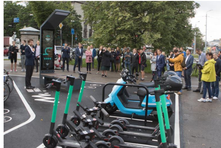
VEF mobility point Riga