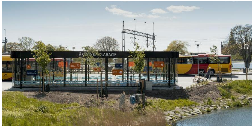
Bicycle garage Kalmar

... connecting cycling, public transports and bike, cargo bike, e-scooter or car sharing