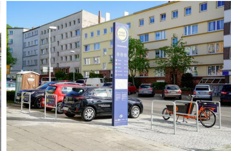
Mobility point Rostock